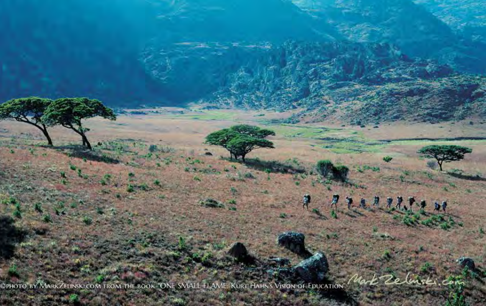
©PHOTO BY MARKZELINSKI.COM FROM THE BOOK "ONE SMALL FLAME: KURT HAHN'S VISION OF EDUCATION"